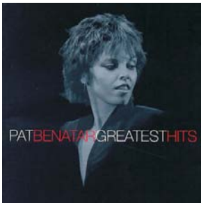
"Hit Me With Your Best Shot" PAT BENATAR