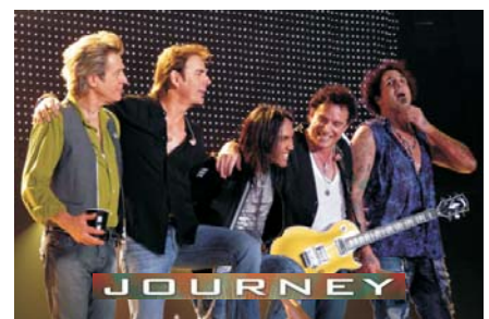
"Who's Crying Now" JOURNEY