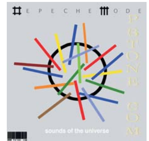
"Personal Jesus" DEPECHE MODE