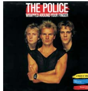
"Wrapped Around Your Finger" THE POLICE