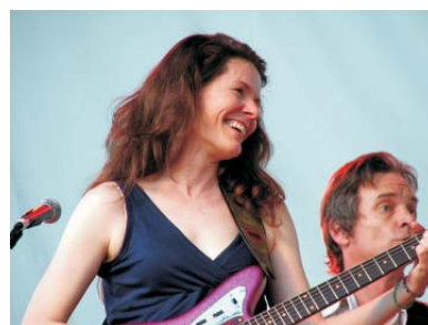
"What I Am" EDIE BRICKELL & NEW BOHEMIANS