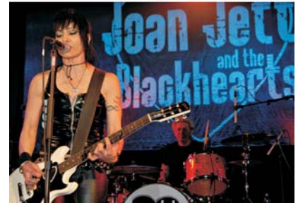
"I Love Rock & Roll" JOAN JETT & BLACKHEARTS