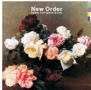
"Blue Monday" NEW ORDER