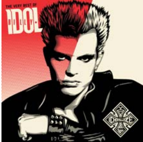
"Eyes Without A Face" BILLY IDOL

"Best of the 80's and more" is the most fitting description of The Point's format. Using a music intensive presentation targeted at Adults 25-44, the station features the best variety of pop, rock, and alternative hits from the mid 80's to the mid 90's. Here's an example of the music you'll hear in a typical hour on 106.9 The Point.