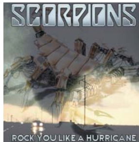
"Rock You Like A Hurricane" SCORPIONS